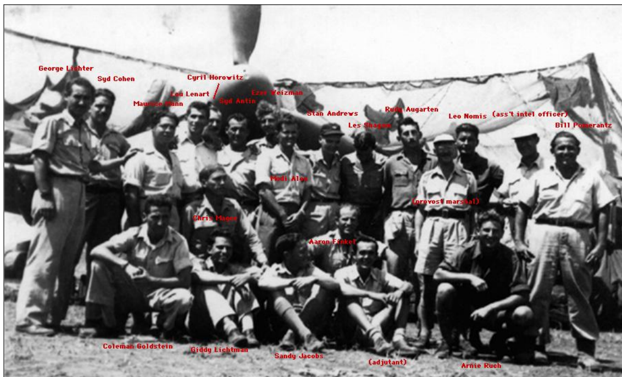
Personál 101. Tayeset