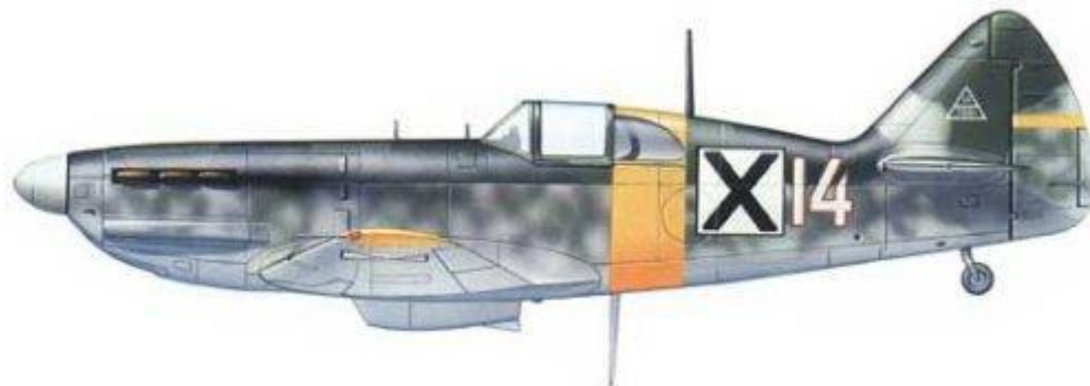
Dewoitine D.520, serial 14, Royal Bulgarian Air Force.